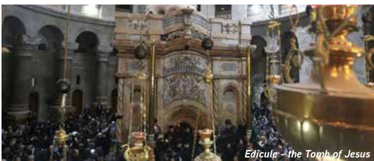
Edicule - the Tomb of Jesus