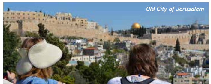
Old City of Jerusalem

Today our Holy Land pilgrimage comes to an end as we transfer to the airport in Tel Aviv to catch our return flight home.