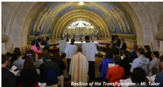
Basilica of the Transfiguration - Mt. Tabor

This morning we will depart Tiberias and travel south through the Jordan valley to the traditional baptismal site on the River Jordan to renew our baptismal vows. The Bible tells us that the Children of Israel crossed the River Jordan opposite Jericho when they came into the Promised Land. The prophet Elijah divided its waters and crossed with Elisha on dry land. Naaman the Syrian dipped in the waters seven times and was cured of his leprosy. And Jesus was baptized by John in the Jordan (Mark 1:9). Each year, pilgrims from far and wide come to the Place of Baptism to immerse themselves in these holy waters. From here, we will visit ancient Jericho, the oldest known city in the Western world. In 1250 B.C., Joshua encircled the city and at the blast of the priests' trumpets, the walls came tumbling down (Joshua 6). Many times Jesus passed through this city on his way to Jerusalem. The sycamore fig, the tree which Zacchaeus climbed in order to catch a glimpse of Jesus, still grows in this area. From the ruins of ancient Jericho, we will ascend the Mount of Temptation where Jesus fasted and prayed forty days to resist the devil. Then drive to the Dead Sea for a swim in its salty, mineral-laden waters. Lastly, we will stop in Bethany to visit the site of the House of Mary, Martha & Lazarus and the Tomb of Lazarus. After Mass, we will continue on to Jerusalem, our home for the next five nights.